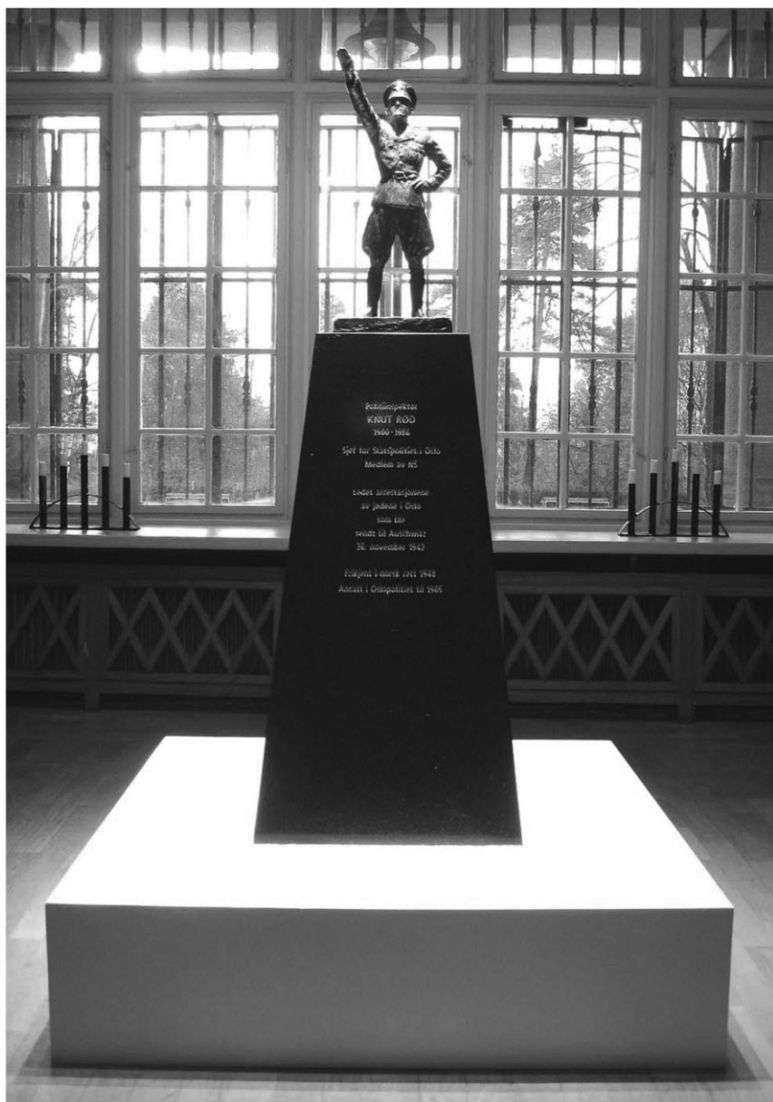
Figure 2: Monument to Knut Rod ( The Perpetrator 2005), by Victor Lind.