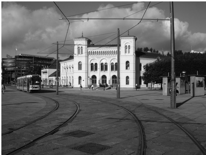
Figure 3: The Nobel Peace Center, Oslo.

the Nobel Peace Center, inaugurated in 2005 to mark the centenary of Norwegian independence (see Figure 3). Its director, Geir Lundestad, described this institution as “a living centre for communicating the ideals of the Nobel Peace Prize and focusing attention on current conflicts”. 44 It occupies a redundant nineteenth-century railway station and on the main façade are written three words: “broadmindedness” ( vidsyn ), “hope” ( håp ) and “commitment” ( engasjement ).